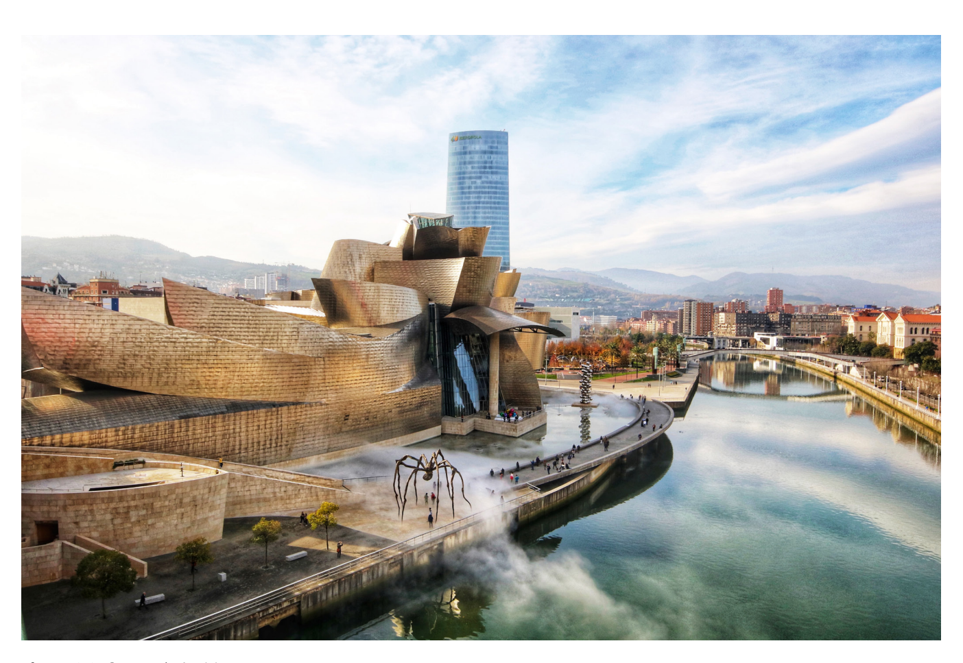
Figure 2.2: Guggenheim Museum.

The Guggenheim Museum was established in 1991 and opened in 1997, designed by Frank Gehry. <sup>45</sup> The museum sits on Bilbao's waterfront and serves as a creative centrepiece to the city's cultural offerings. Since opening, the museum has attracted 1 million visitors per year <sup>46</sup> and has contributed an additional $212m to Bilbao's GDP. <sup>47</sup>