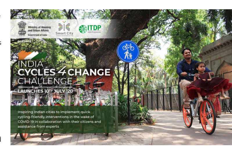
Figure 6.2: Cycle for Change Initiative.

since been extended to 2023 due to the slow progress in its implementation. ^{184} This has been further impeded by the impact of COVID-19. ^{185}