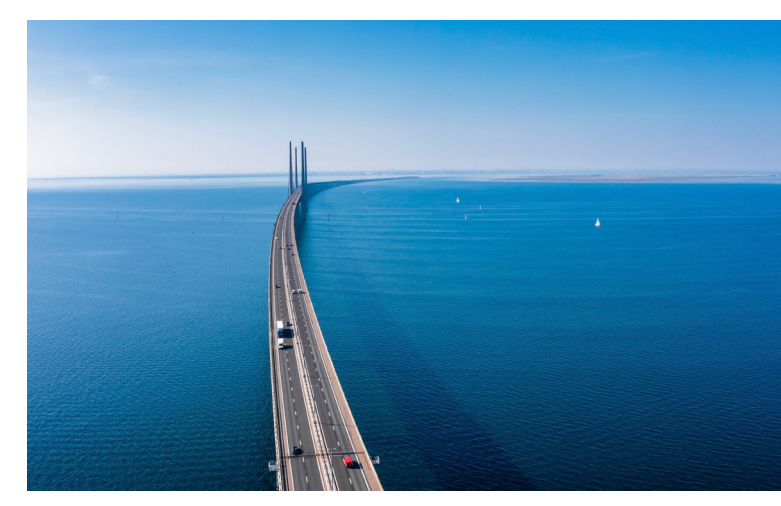
Figure 4.3: Øresund Bridge.

Following the financial crisis of 2008, integration plateaued due a decline in house prices in Copenhagen, a rise in house prices in Malmö and fluctuations in currency exchange rates. 117 Case study participants noted that in recent years, the cross-border labour market has been hindered by stricter border controls and COVID-19 travel restrictions. Indeed, one observed that due to the complications caused by these increased restrictions, many people are looking for new employment opportunities that do not involve using the bridge.