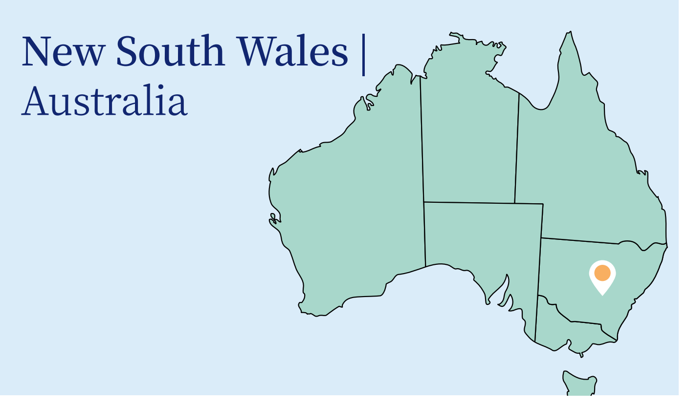
Figure 3.1: New South Wales in its context.