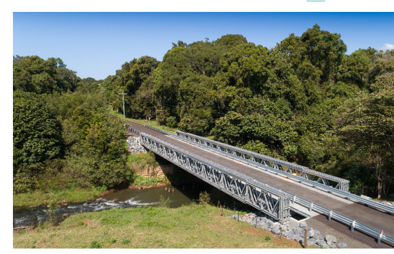
Figures 3.2 and 3.3: Project examples

The example of regional digital connectivity suggests that when investing in infrastructure, interventions should be focused on market failure where the private sector is unlikely to invest but where infrastructure investment could be transformative.