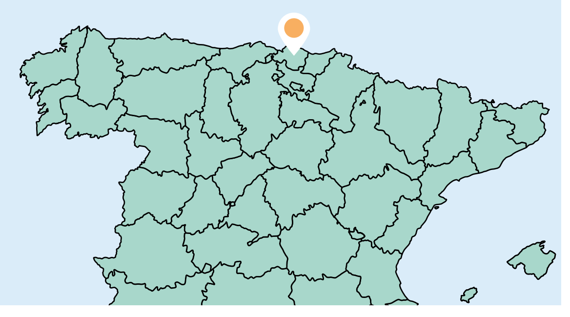
Figure 2.1: Bilbao in its context.