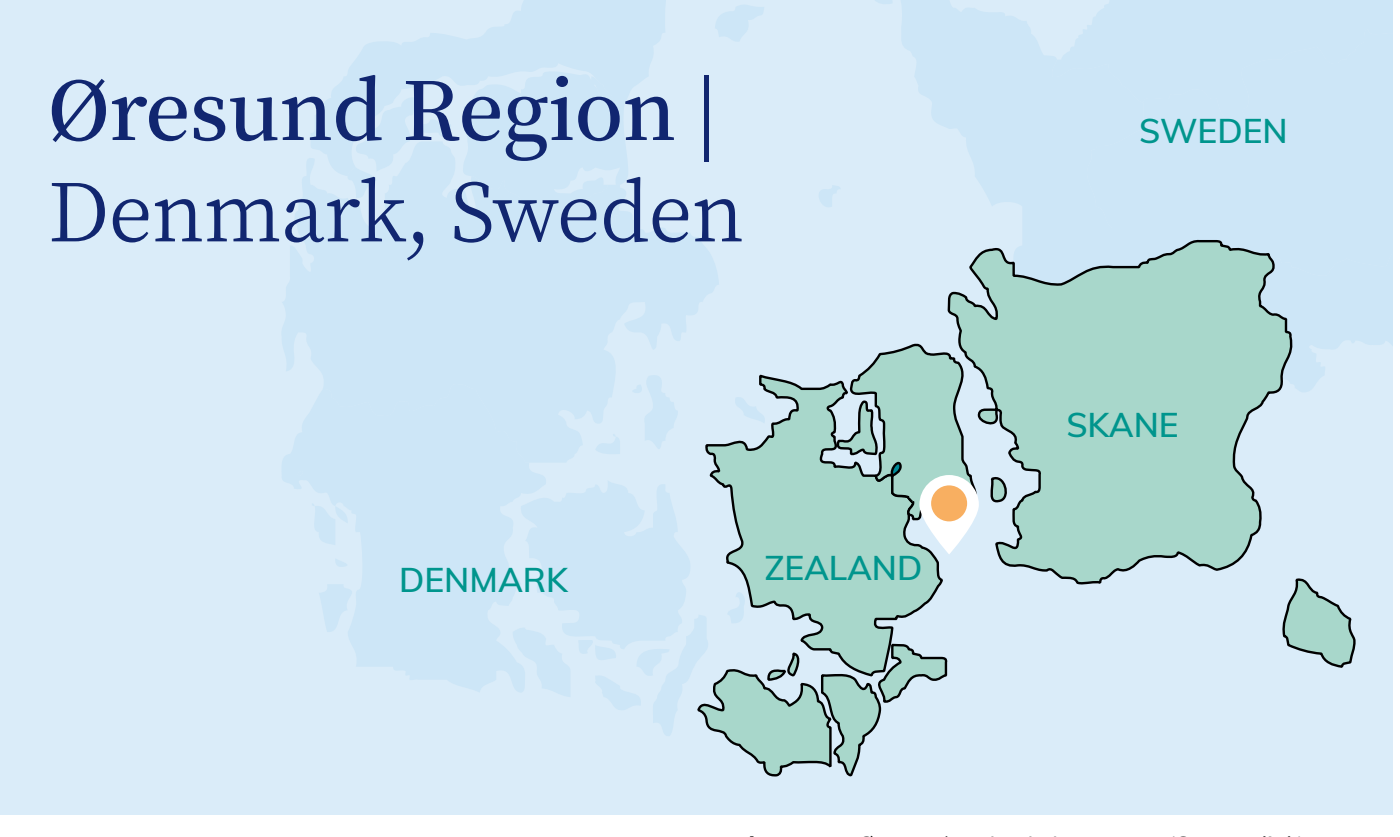
Figure 4.1: Øresund region in its context.