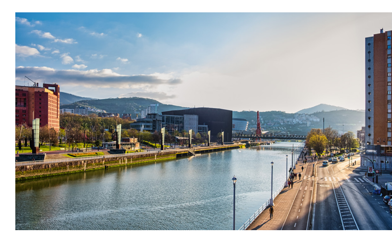
Figure 2.4: Bilbao's connectivity, shown is the Nervión river and adjacent tram lines

Finally, the fiscal and governance freedoms afforded to the Basque region were essential to Bilbao's regeneration.<sup>57</sup> In particular, the tax raising powers of the provincial government have been identified as very important to the ability to fund investment.<sup>58</sup>