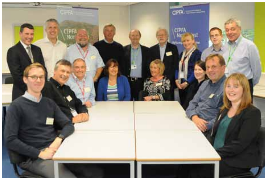
Volunteers at last October's sixth-form games at South Tyneside College

CIPFA North East is running three sixth form management games this year following the success of the first two years. The games are valued by sixth-formers and teaching staff alike, but they simply would not happen without CIPFA members and students.