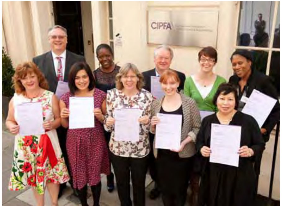
Charity finance and accountancy graduates with their certificates

"I am sure that this success will prove invaluable in furthering your career and in supporting further advances in the governance of the organisations that you work with."