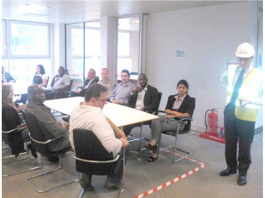
Mansell Street - a work in progress