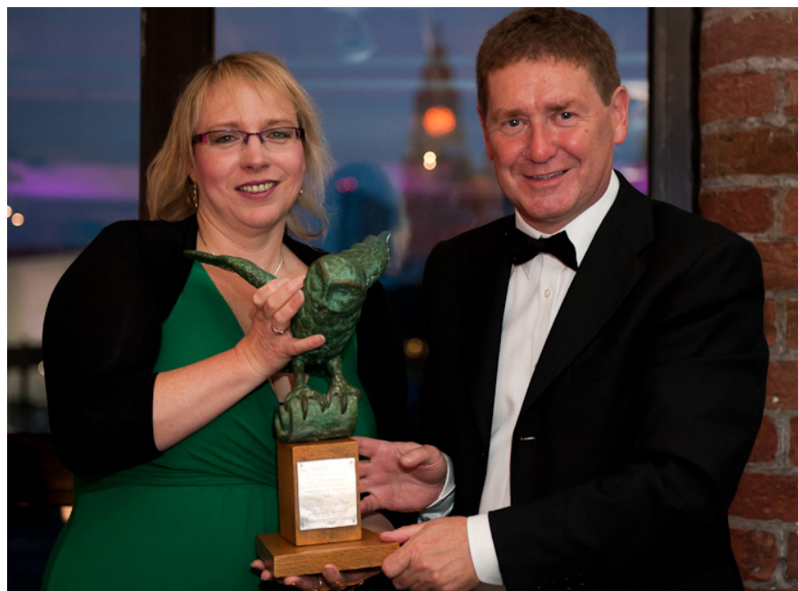
Members of the HM Treasury's Whole of Government Accounts team accepting last year's Sir Harry Page Award