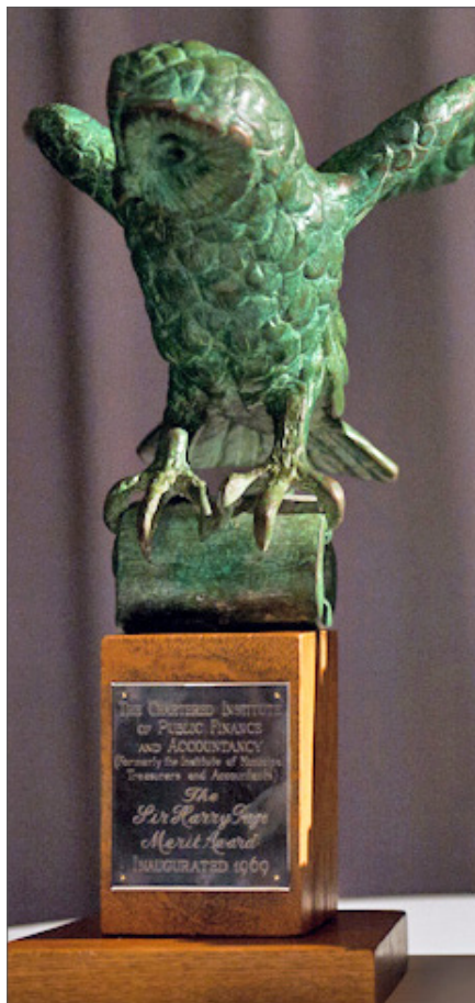
The Sir Harry Page Merit Award