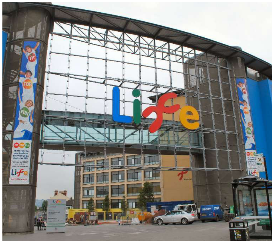
The Centre for Life, Newcastle-upon-Tyne