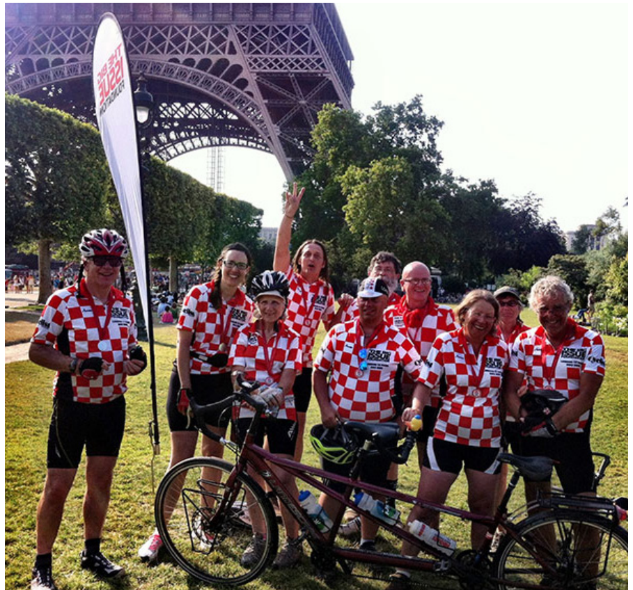
Last year's Big Issue Foundation cycling team